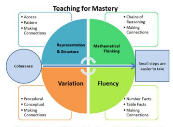
(NCETM - Teaching for Mastery - The 5 Big Ideas)

The Mastery in Mathematics approach is characterised by the principles that all pupils are capable of achieving their potential in Mathematics and that pupils progress through the curriculum at the same pace. Differentiation is achieved by emphasising deep knowledge through scaffolding, intervening and individual support.